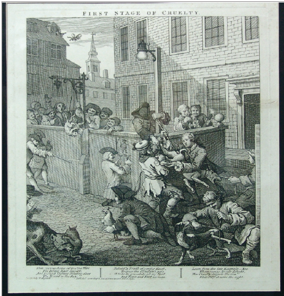
Figure 1: First Stage of Cruelty, William Hogarth (1751).

spaniels was favoured in England and France (Thomas 1983, 116; Simoons 1994, 239).